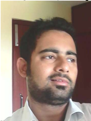
Facing Sideways X