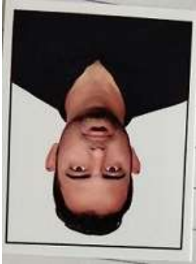
Inverse Photo X