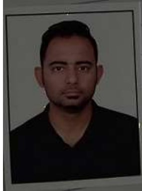
Too Dark X