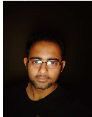
with Spectacles X