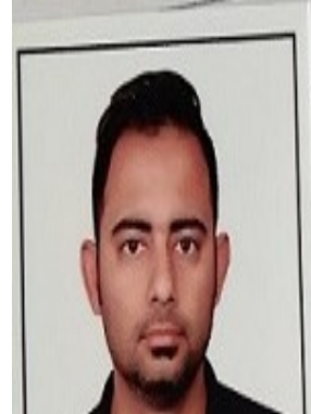
Too Close X