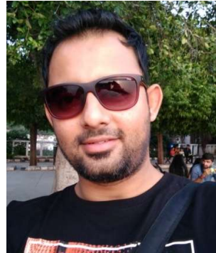
With Googles X