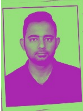
Too much Extra Color X