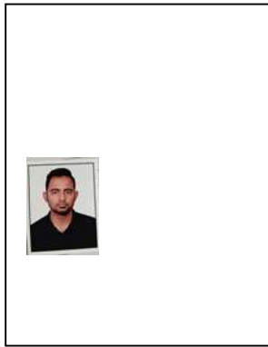
Too Small X